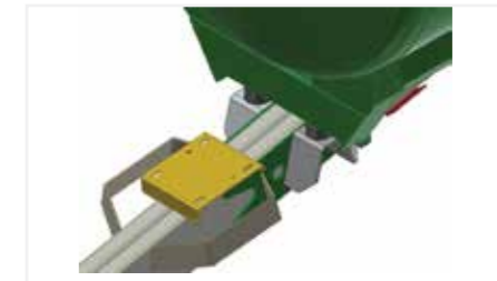
Drawbar is fitted with rubber buffers to give a smoother and safer journey