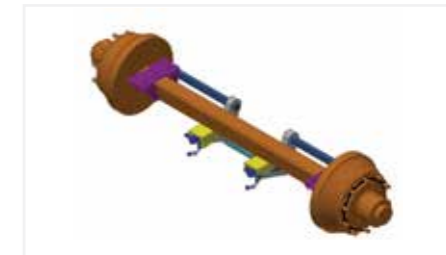
Hydraulic brakes as standard ensuring compliance with the regulations for this model of tanker