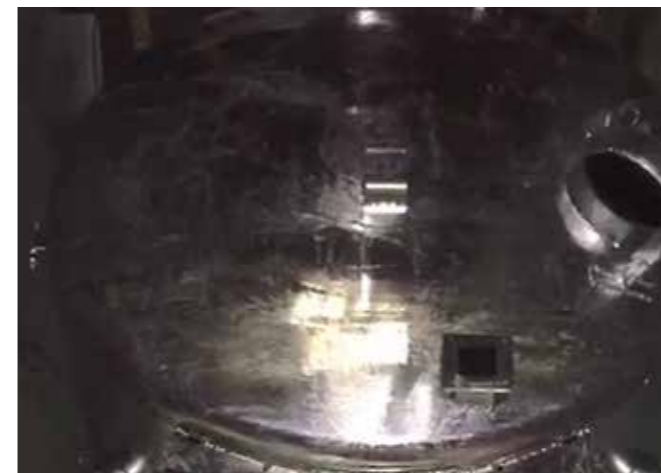
All Major tankers are galvanized inside and out for durability and long life.