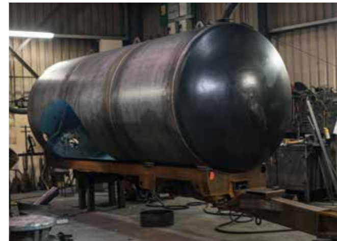
The joints on the tank are welded to ensure a high-quality and visually perfect weld seam.