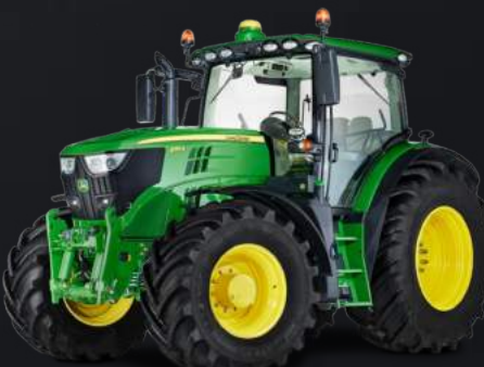
John Deere 6145 John Deere 6155 John Deere 6215