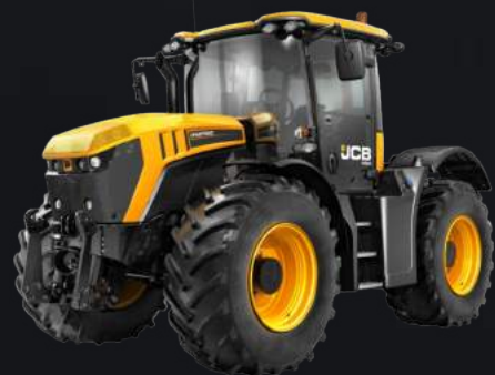
JCB Fastrac 4220