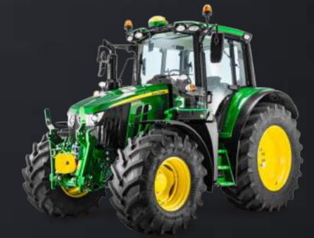
John Deere 6120M